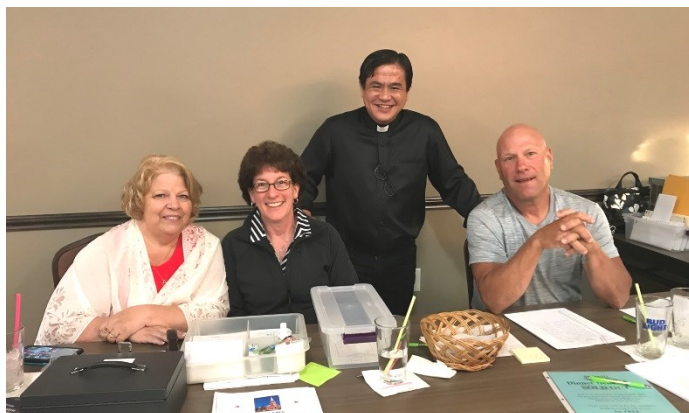
Photos from last years Dinner & Dance