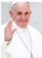
Pope Francis said: